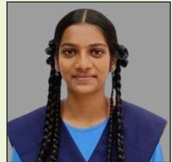
B Shadhanaa 550/600