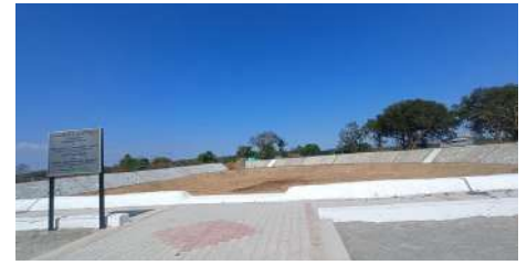
Kannanthangal Pond was restored at a cost of ₹1.05 crore, increasing its water holding capacity from 23 million to 32.95 million litres, thereby benefiting 13,000 villagers. Solar streetlights were installed around the perimeter.

This is the fourth pond project that BorgWarner has partnered on with Sevalaya.