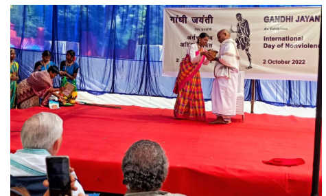
Chennai on 3 rd October 2022.

Thanks to donor support, the children could visit some of the important tourist spots in Delhi before boarding the train to