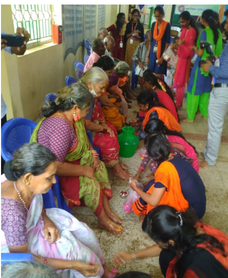
S A College of Arts & Science, National Service Scheme (VeeraRaghavapuram, Avadi), organized Grandparents Day at Kasuva centre on 28 th March 2022 to honour our grandpas and grandmas.

50 students from S A college participated in the event.