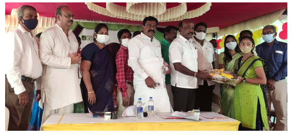
Health Minister Ma Subramanian handing over sanitary kit to a beneficiary. In picture: Minister for Milk and dairy development Avadi S M Nasser and Honourable Member of the Legislative Assembly A Krishnaswamy.

Honourable Minister for Milk and Dairy Development Avadi S M Nasar was the