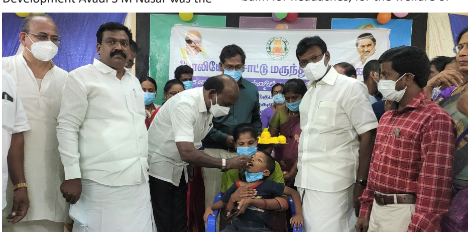
Health Minister Ma Subramanian administering poliodrops as Minister Avadi Nasser and MLA A Krishnaswamy looks on.

Sevalaya is ready to extend this project to other districts in Tamilnadu with the support of sponsors.