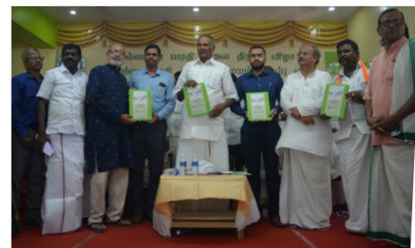
Release of 34th Annual Report