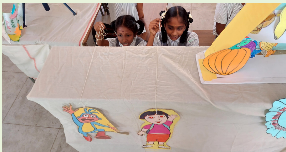
Puppet show made easy