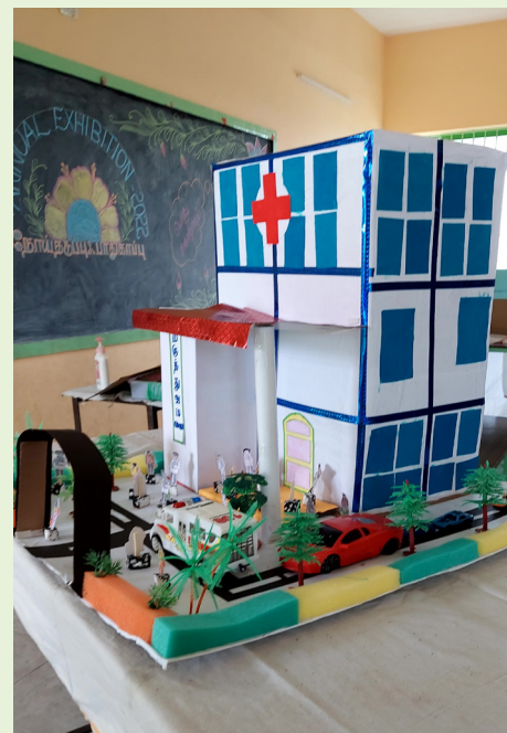
Message: Prevention is the way to avoid going to the hospital, which is now a crowded place