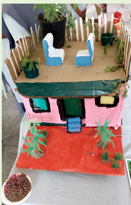
Houses, factories....They made them all with imagination and creativity