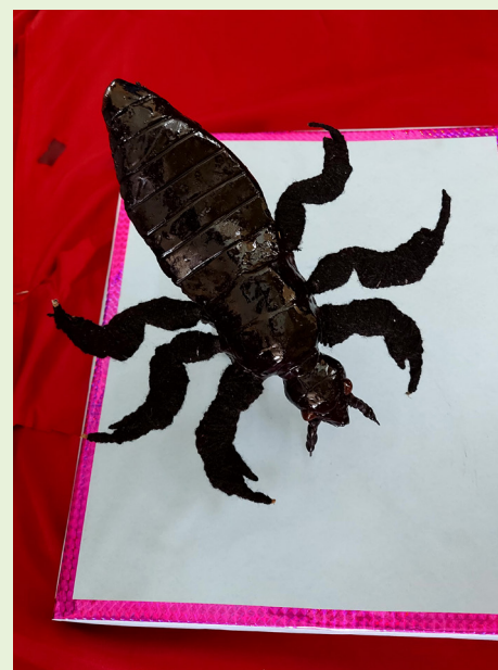
Models made from shampoo bottle, woollen thread, metal rods, hose pipe, paper of various types, clay and oil paints