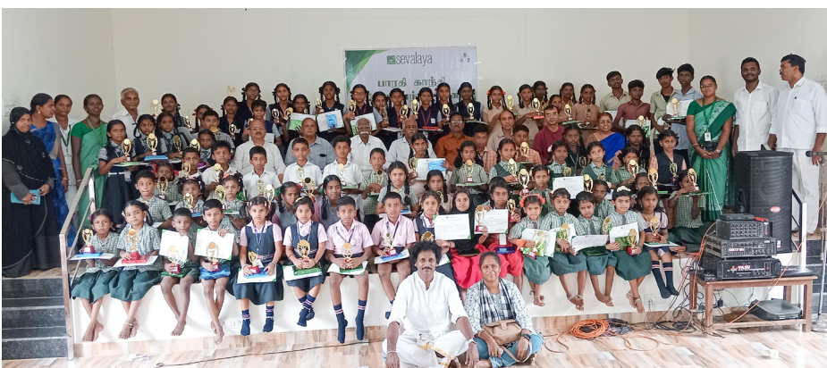
Students proudly shows off their certificates from the BGV competitions, along with the Special Guests

On 11 th September 2023, Bharathi Gandhi Vivekananda (BGV) Day was celebrated at Chellamma Bharathi Learning Centre