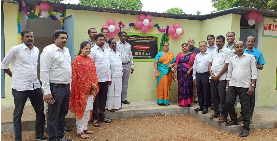
Officials from Heat and Control Pvt Ltd, Govt school staff, and Village president join hands inaugurating the boys toilet renovation project

Heat and Control Pvt Ltd has sponsored ₹9.81 lacs to help over 450 underprivileged students, as part of their Corporate Social Responsibility.