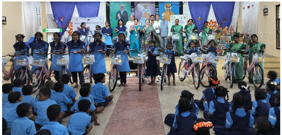
Members of Rotary Club of Chennai Bharathi donate 15 cycles to girls and 5 cycles to staff.