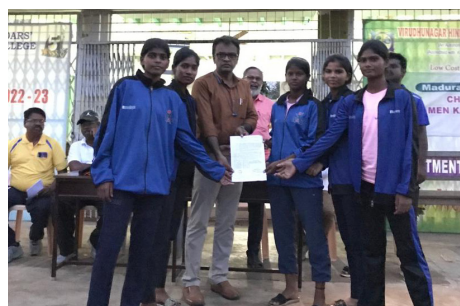
6 out of 9 students from Sevalaya's Mahakavi Bharathiyar Higher Secondary

School, Kasuva centre, have been selected for the Tamil Nadu Netball team. The selection trial was conducted by SGFI (School Games Federation of India) at Virudhunagar Hindu Nadars Senthikumara Nadar College on 10 th October 2023.