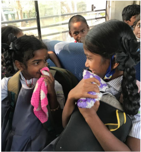
Continue on page 4