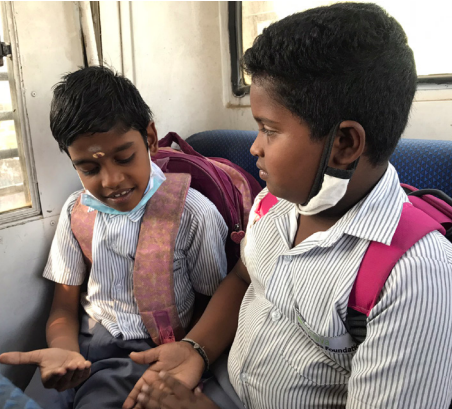
LOVE ALL SERVE ALL

"In these troubling times, I am really grateful to Sevalaya for all the safety measures they take. I fully trust Sevalaya and know my children are in safe hands".