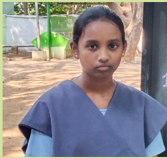
Thembhavani T 514/600