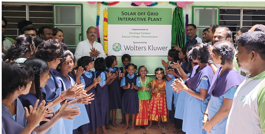
Inauguration of Solar Off Grid Interactive Plant at Sri Ramakrishna Paramahansa Old Age Home

Wolters Kluwer had earlier sponsored a pharmacy building for Mahatma Gandhi Medical Centre in Kasuva. They also installed two 500-litre Solar water heaters for Old Age Home, and a 5-kilowatt Solar Power Plant at Mahakavi