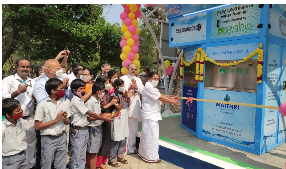
Forest Minister Inaugurating Air to Water project