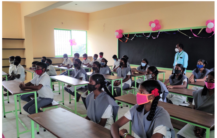
The modern classroom sponsored by DTCC

Five companies jointly funded ₹2 crores for the construction of the new primary school building at Sevalaya's Kasuva centre, as a part of their CSR initiatives.