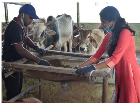
On 22 nd November 2019, 7 students from final year Science and Humanities

Department of SRM University visited Sevalaya's Kasuva campus. They planted 15 coconut saplings near the Gaupooja stage, sieved 5 kg of vermicompost and spent time with elders. They played games and sang songs with the elders.