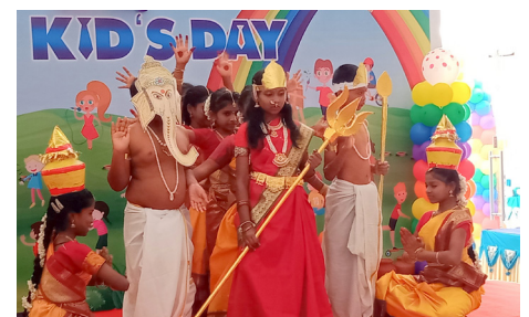
Children's day celebration at Prestige Bella Vista Apartments, Iyappanthangal.

Children of Sevalaya and the city children both enjoyed this endeavour to highlight the traditions of the state and Sevalaya children were presented mementos at the end of the programme.