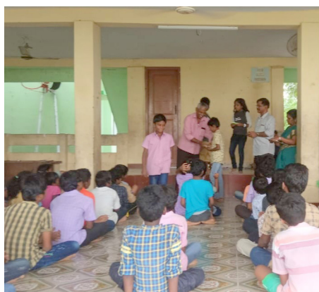
Members of "PASAM Train Friends" conducting games for Hostelites.

Pasam Train Friends group came to Sevalaya on 17 th November 2019 to spend a day with the hostel children conducting games and having a jolly time with the children. This group of friends have been coming regularly since the past 19 years with their families. They sponsor the lunch for the children, organise games and give gifts to all the children. They also motivated the children through their speeches. This group of friends used to travel together by train to work but are now retired. Earlier their children would play with the hostelites. Their children are now settled in various places but the group continues its annual visits.