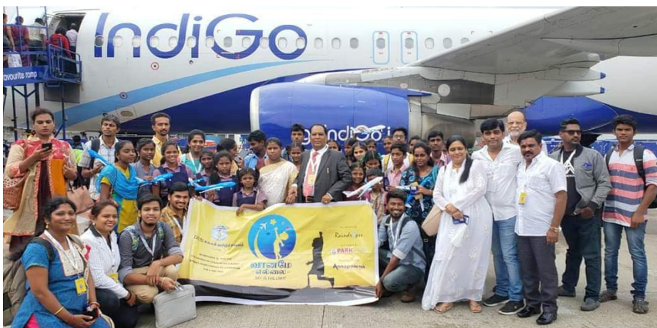
Five Sevalaya children were among this group that boarded the flight.

Five students from Sevalaya were among the lucky 25 underprivileged who got a chance to fly from Chennai to Coimbatore on 22 nd November 2019.