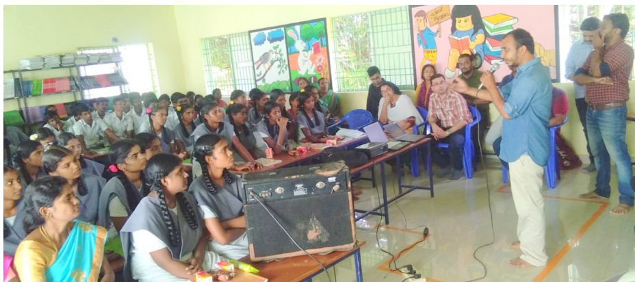
Volunteers from Standard Chartered Global Business Service giving awareness of banking services.

A banking awareness session was conducted by 11 volunteers from Standard Chartered Global Business Services for 70 students of Std XI, XII and 35 parents on 16 th November 2019 at Kasuva. A detailed explanation of the working of the banking sector, safe use of the cheque books and pass book,