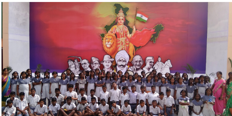
Students in front of the portatrai of Bharat Matha at Kalaivanar Arangam