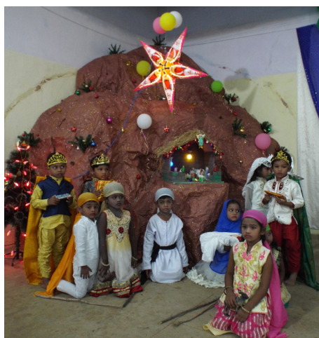
Manger scene at Christmas festival