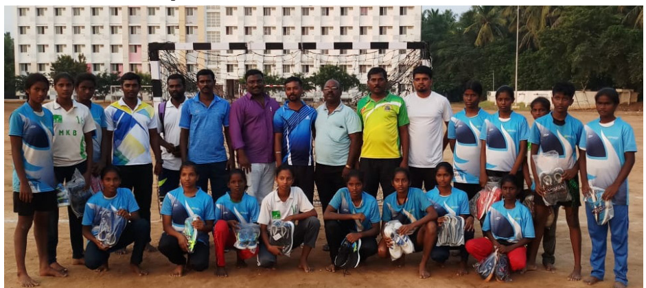
Sevalaya under 17 Handball team

The Republic Day State level Tournament was organised by the Directorate of School Education, Tamilnadu. The under 17 Girls Handball tournament was held at Kumarasamy Engineering College Thalavapalayam, Karur from 16 th November to 18 th November 2018. Sevalaya's under 17 girls team won the third place at the tournament.