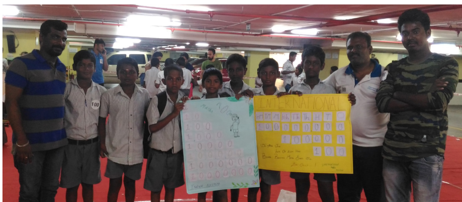
Students proudly displaying their creations, with volunteers from Standard Chartered Global Business Solutions

250 children from Stds VI and VII were invited to participate in Project Day at Standard Chartered – Global Business Solutions (SC – GBS). A team of 50