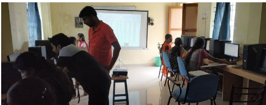
BNY STEPS programme in progress

Volunteers from BNY Mellon conduct a Special Training programme - BNY STEPS on every Sunday for Sevalaya alumni who are in final year undergraduate course and those who have completed under graduation and are searching for