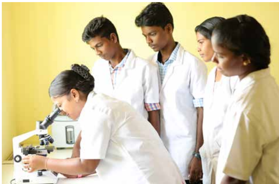
Rural village students using state-of-the-art equipments as part of lab technician training

The community college at Kasuva offers free vocational training courses, which will enable the poor youth who have dropped out of school or completed school but could not pursue higher education for various reasons, to learn a skill/trade and earn their living. This year a new one year course for Lab technician