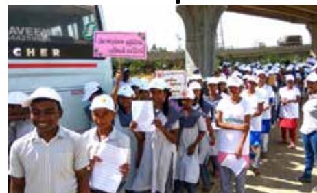
Sevalaya kids spread "no plastic" message in Thiruninravur

Visai, an NGO working for environment protection, organised a rally to create an awareness about the ill effects of plastics on 23 rd June 2018. 50 students of Std IX represented Sevalaya in the rally in which 300 students from various neighbouring schools participated. The students carried placards and raised slogans about the harmful effects of plastic.