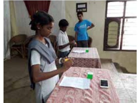
Rubic cube competition in progress