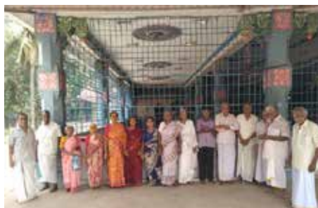
Senior citizens at Alamaadheeshwarar temple, Alamaadhi, Redhills