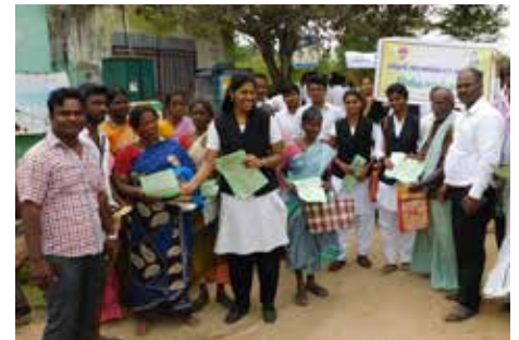
Law students creating an awareness among rural villagers

Earlier in the day, a workshop was held for Law students and a rally held to create awareness about food safety and the importance of FSSAI logo in