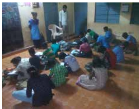
Tuition session in progress

He teaches all the five major subjects for three days a week and has roped in another teacher for the other three days. About 30 students come each day to