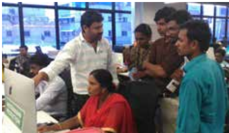
Industrial visit to Jouve India by E-Publishing students of Sevalaya's Ambattur Community College

Jouve India provides internship opportunities to the E publishing students of Ambattur Community College. The Nursing Assistant students of Kasuva centre get opportunities to intern with Portea Health Services. Imperial Garments India at Sriperumbudur and Suprajit Engineering offer internship opportunities for the students at Sevalaya's Mambakkam centre.