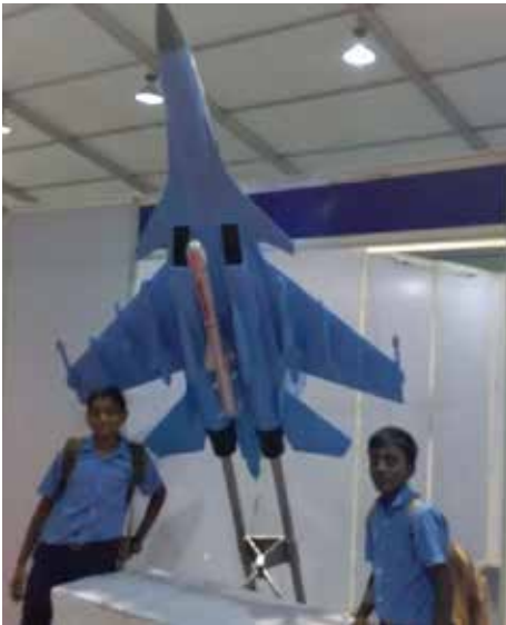
Students posing in front of fighter aircraft

On 14 th October 2017, Standard Chartered-GBS, Chennai organized two programmes for the students. One was a big bash at their office for 325 primary school children (Std II – Std IV). The music and dance events and games organised for the students held them in awe. There were many events designed for the tiny tots – like drawing, sketching, pool, and games with cartoon characters. The