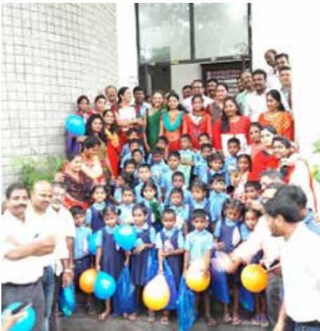
Staff from Sanofi fulfilling the children's wishes on the occasion of Daan Utsav

Sevalaya has been a part of Daan Utsav – a celebration of philanthropy since 2009. It coincides with a week long program from 2 nd October. Millions of people from all walks of life come together during this week to give their time, money, resources, or skills back to society, by creating or participating in events of their choice.