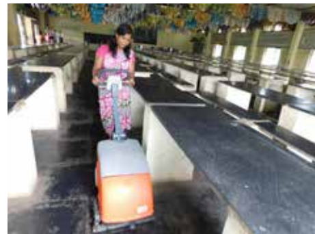
Floor cleaning machine by Rotork Controls India for dining hall

Rotork India, a market leader in actuator manufacturing and flow control has sponsored four projects in different areas around the campus- A floor cleaning machine for the dining room, which has reduced the cleaning time to less than one and half hours (for all three meals). This has freed up the man power to perform other activities around the campus. Rotork Controls (India) has also sponsored a steam boiler for the kitchen which has significantly speeded up the turnaround time for preparing dishes between meals. Simultaneously the tiling and painting of the kitchen was also taken up which has brightened the work environment and productivity. Last but not the least, pavement and reflectors to aid the senior citizens find their way to their rooms before dawn and after dusk has encouraged them to venture out with more confidence.