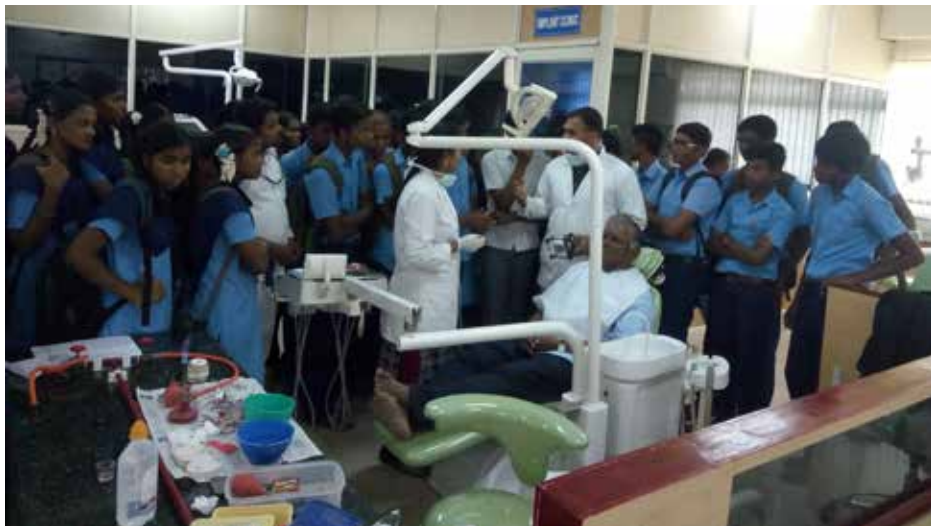
Sevalaya students observing dental procedure at SRM medical college

On 25 th September 2017, 50 students accompanied by 2 staff visited Shri Venkateshwara college of Engineering, Sriperumbudur. The students got an idea about the various courses offered by the college and the career opportunities available for each course, at the orientation programme. They also visited the labs of various departments, libraries and other facilities at the college.