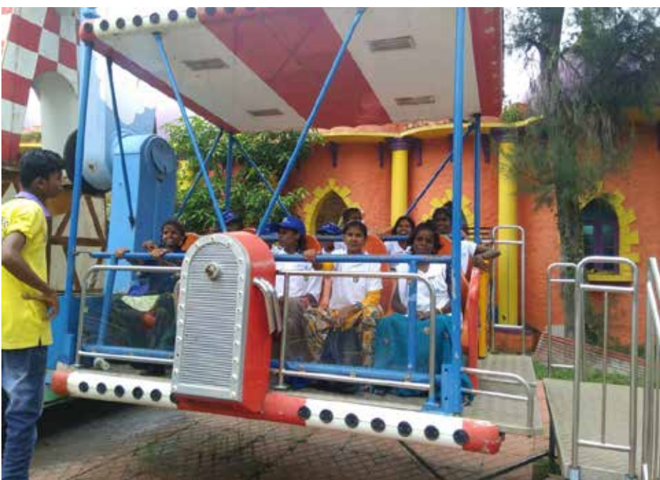
Children enjoying the various rides at VGP Golden Beach Resort, Chennai