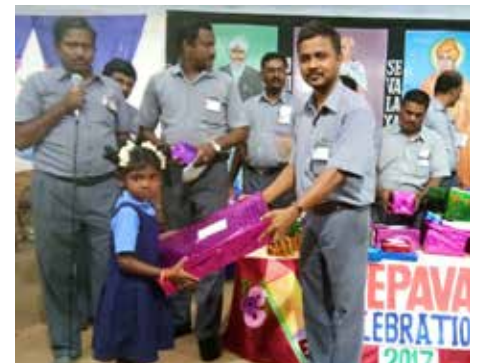
Staff of Sundaram fasteners presenting gift to Sevalaya children

Students from 10 urban schools visited Sevalaya and exchanged gifts with Sevalaya students. Sevalaya children made new friends from other schools and their harmonious exchange of gifts and friendly banter was a sight to behold.