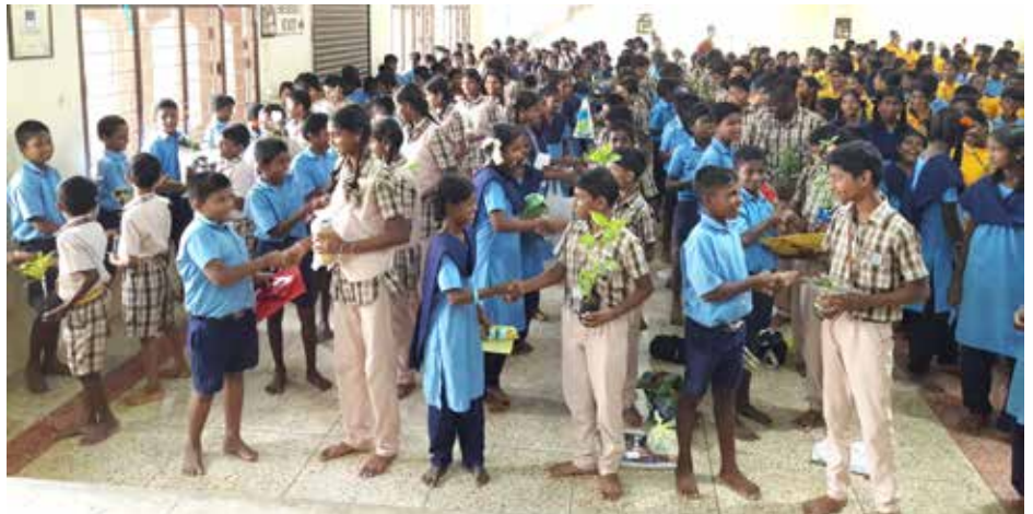
Exchange of gifts strengthened the bonds of friendship between students of Sevalaya and other school during Joy of Giving Week

Sevalaya stalls were also located in all these corporate houses, which were manned by Sevalaya staff. They highlighted the various activities at Sevalaya mostly relating to the quality of education imparted by the school. Many staff expressed surprise about the range of services which are provided free of