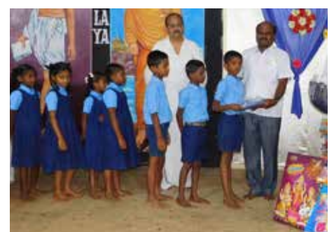
Children receiving new clothes and sweets