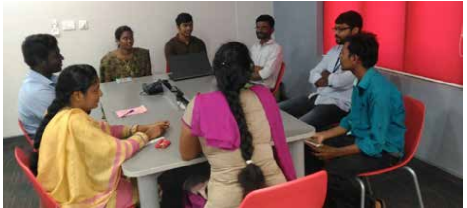
Interaction between Jouve staff and E-Publishing students

Sevalaya's partners in various locations mention that the quality of the students who come out of the community college seem more knowledgeable and require very little training, once they get into the workforce.