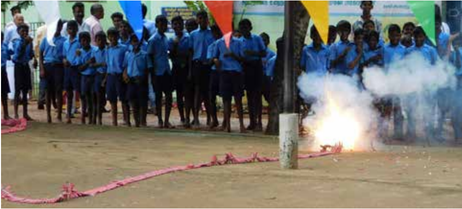
Children watching with glee the beginning of Deepavali celebration at Sevalaya campus

Deepavali , the festival of lights was celebrated at Kasuva Campus and off campus where the children and elders were invited to take part in the festivities marking the triumph of good over evil.