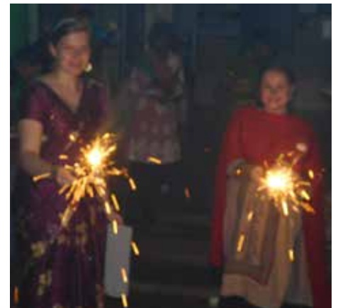
The Volunteers from UK celebrating Deepavali in traditional dress

Sevalaya thanks the numerous individuals, and institutions who donated rice, wheat flour, sweets and savouries, fireworks, toiletries, and sponsored dress material to the children and elders for Deepavali.