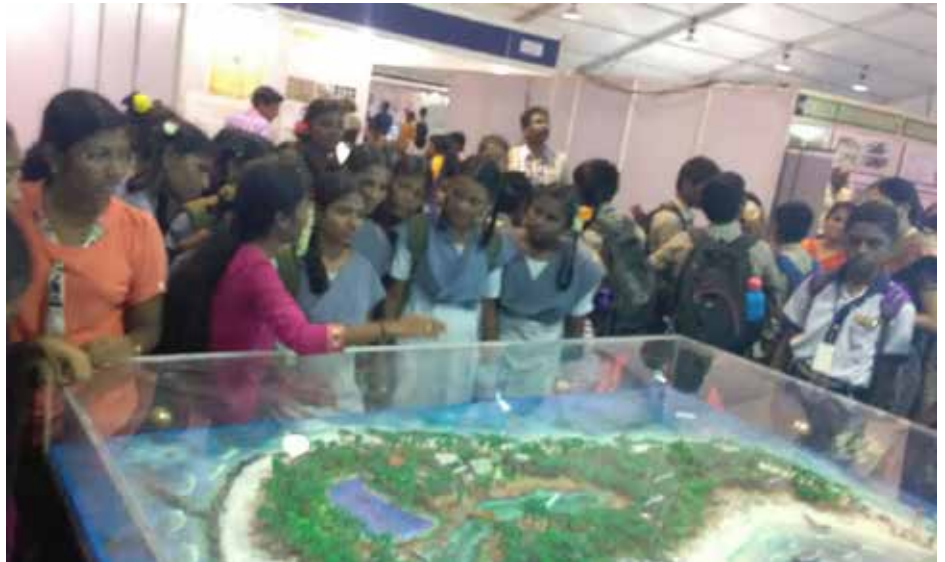
Sevalaya students at the India International Science Festival at Anna University

children soaked them all up and many prizes were distributed to them for participating and winning in the events.