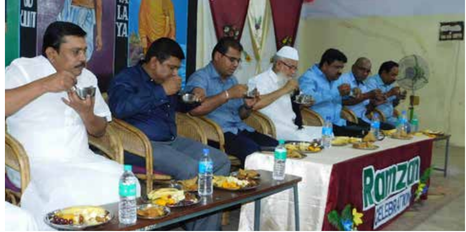
Chief Guests breaking the fast with Nonbu Kanji (porridge)

Iftar party was organized on 15th June 2017, to mark Ramzan, at Kasuva campus. Sevalaya firmly believes that