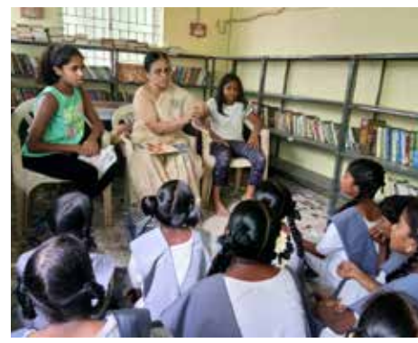
Craft session in progress

Some of the important fund raising techniques that were discussed were ways to talk to individual donors, the concept of every employee being a fund raiser for the organization, proper maintenance of donor data, marketing techniques and ways to approach corporate institutions for sponsoring projects.