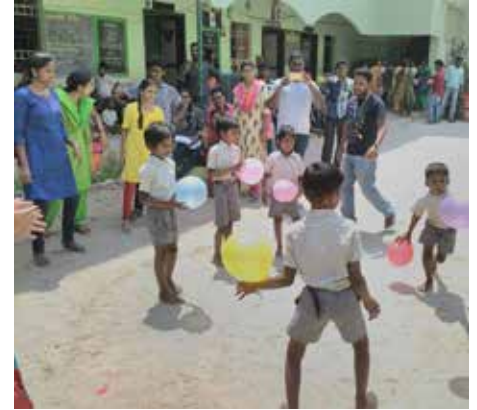
Left : Spoon and Lemon race for the primary children