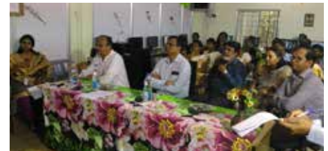
Video inauguration of Tally course from Mumbai

courses free of cost to underprivileged students.