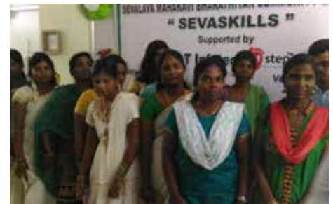
Students of Mahakavi Bharathiyar Community College, Ambattur