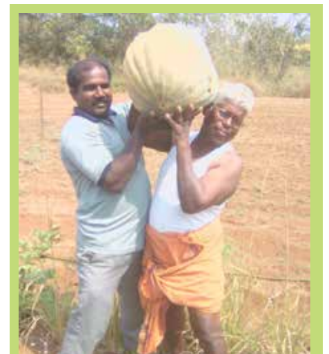
Mega yellow pumpkin weighing 16.5 Kgs from Sevalaya's organic farm at Madurantakam

The students felt confident that they will secure placement in the E-publishing industry on completion of the course.