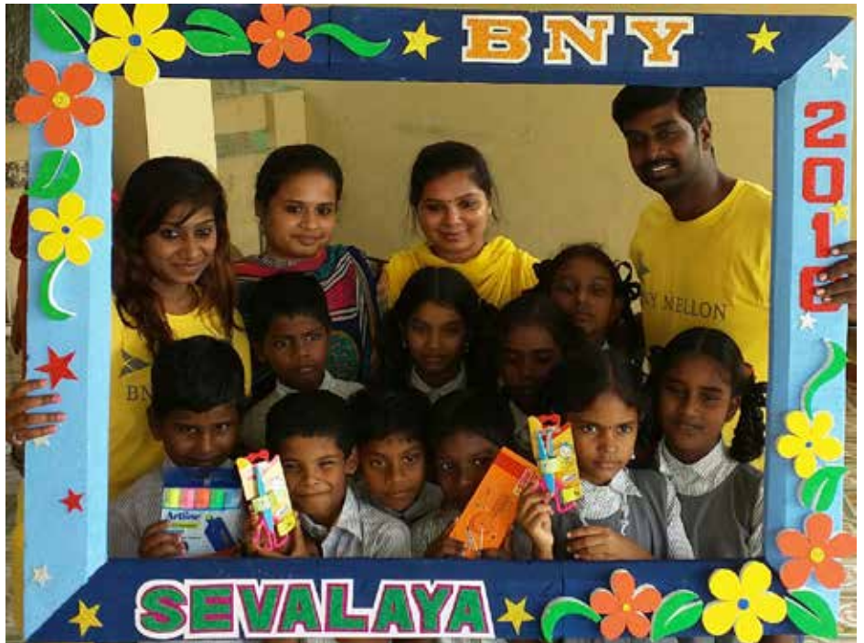
Cheerful Montessori students and volunteers peer through a handmade 'photo frame'

BNY Mellon volunteers had visited Sevalaya almost every weekend in 2016. The sheer breadth of activities performed by the volunteers is staggering. It includes Library book data entry, creative classroom activities for students in primary school and hostel students, wall painting activities, teaching accountancy