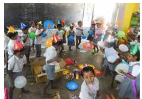
Montessori children enjoying the party supplies donated by Snapdeal

Sevalaya children received as gifts celebration packs comprising of balloons, decoration material, party caps, Frisbee, pencil boxes and 2000 crayons, donated by Snapdeal, an Indian E-commerce company. The company donated these materials to NGOs during Christmas and New Year. The children enjoyed the gifts and many were seen drawing and colouring with the crayons with great zeal. Thank you Snapdeal, for brightening the lives of the children.