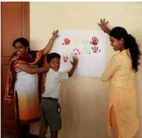
Arts and craft activity with primary school students

BNY Mellon's round-the-year support encompasses multiple spheres. Add to it the enthusiastic week end visits by its employees.