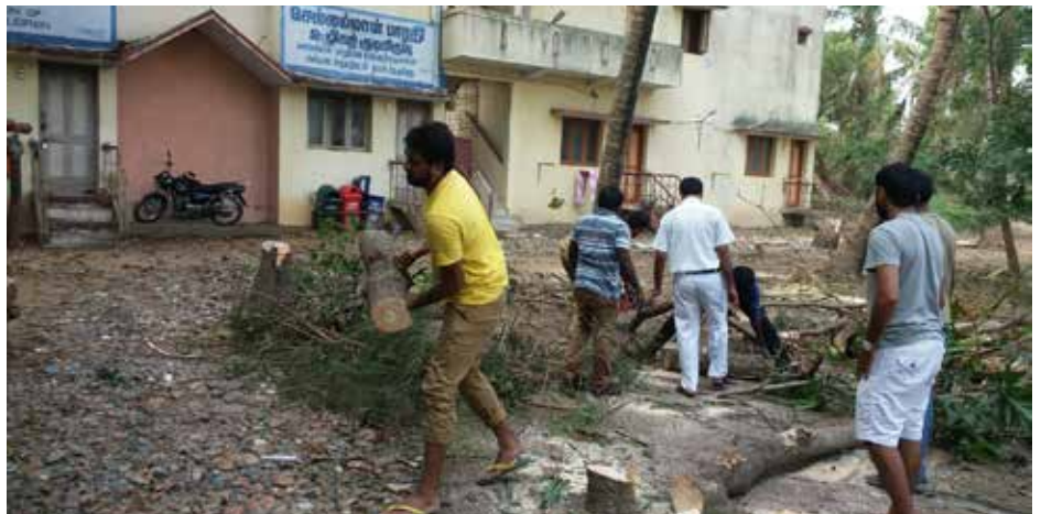
A swarm of volunteers descended on campus to clear the debris, after the fury of Cyclone Vardah