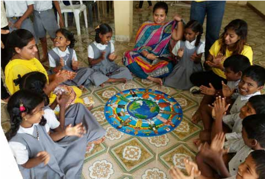
Creative learning activity with Montessori students

classes for Std. XI students, fruit tree plantation at school and Student homes, conducting summer camps, imparting value based education for students, among other things. Till December 31, 2016, BNY Mellon volunteers were in Sevalaya campus for 34 weekends. It certainly looks as though they made Sevalaya their second home!