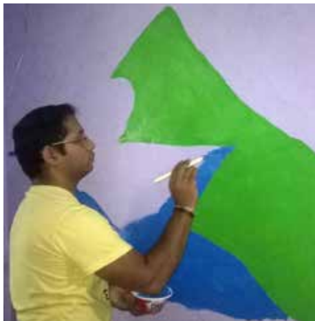
Volunteer brightening up a classroom with vivid painting

As Sevalaya was reeling after the onslaught of Cyclone Vardah, the first call for physical help came from BNY Mellon. 34 volunteers from the company came the same weekend to help in clearing out the fallen trees and debris. It was due to their presence that weekend that Sevalaya staff got a breather from the nonstop work after the cyclone. The place bore some semblance to the old Sevalaya, though thousands of birds left Sevalaya and sought sanctuary in other places, due to all the felled trees.