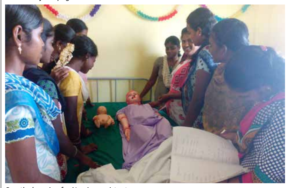
Practical session for Nursing assistants

temple at Triplicane, which lifted the poet and threw him on the ground, when the people around watched helplessly and were scared to go near and rescue him. The Mobile Medical Van which will reach out to the villagers in times of need and provide medical assistance, is aptly name after Kuvalai Kannan.