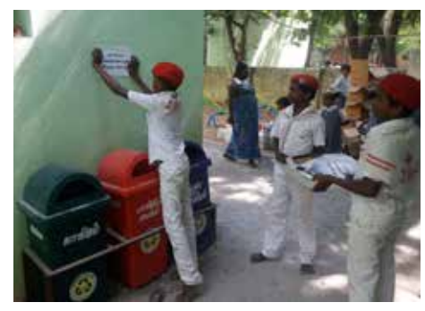
Sevalaya's JRC students spreading awareness about the need to keep the campus clean, at all times

thin plastic bags, which is turning into a scourge in many parts of the metropolis and suburbs. Bio degradable wastes are separately collected and converted into organic manure. Training was given on the proper usage of bins to all the students, staff and residents of Sevalaya by staff S C Suresh who is in charge of the Green Campus initiative of Sevalaya.