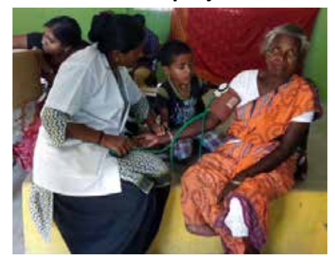
As part of mobile medical clinic project of BNY Mellon, Sevalaya conducted medical camp at Ayalur village, in which 115 villagers were screened.