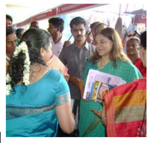
Union Cabinet Minister for Women and Child Development, Maneka Gandhi visiting the stall

The 6th annual fair was conducted by the Hindu Spiritual and Services Foundation from 8th to 14th July 2014 at Sri Ramachandra Medical Grounds, Thiruvanmiyur, Chennai. Sevalaya participated in the Fair by setting up a stall, describing the various activities of Sevalaya. The stall also had several Craft items, Bags and Wood Items made by the Students of Sevalava on display, Minister for Women and Child Development, Maneka Gandhi visited the Sevalaya stall during her visit to the fair. The visitors to Sevalaya Stall got a good idea about the services rendered by the organization. The stall also received wide coverage by the media both, print and electronic.