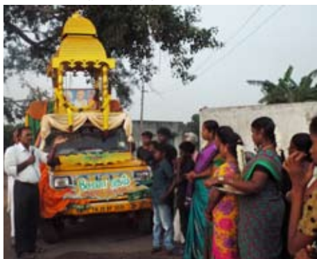
Seva ratham has been visiting villages ever since its flag off by Swami Omkarananda Maharaj Ji on 11th