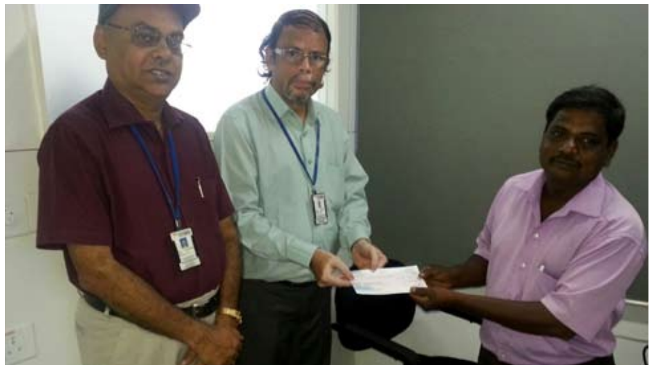
Sevalaya PR receiving the cheque from CAMS

Computer Age Management Services, as part of their CSR activities, are sponsoring the educational expenses of 203 under-privileged students of Sevalaya.