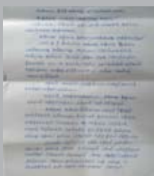
(L) Picture of Bharathi drawn by a prisoner in his answer sheet. (R) Bharathi Exam answer from a resident of Central Prison, Coimbatore.