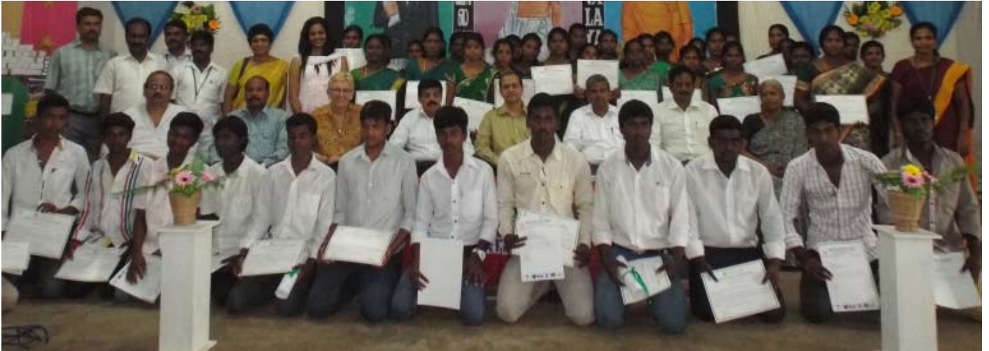
The students of Community College with their certificates and employment orders

Out of 43, ten net jobs at passing out event