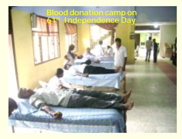
of the Hostel campus on 04/08/2008 and the school campus on 21/08/2008.