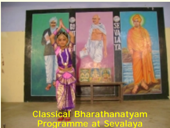
Classical Bharathanatyam Programme at Sevalaya