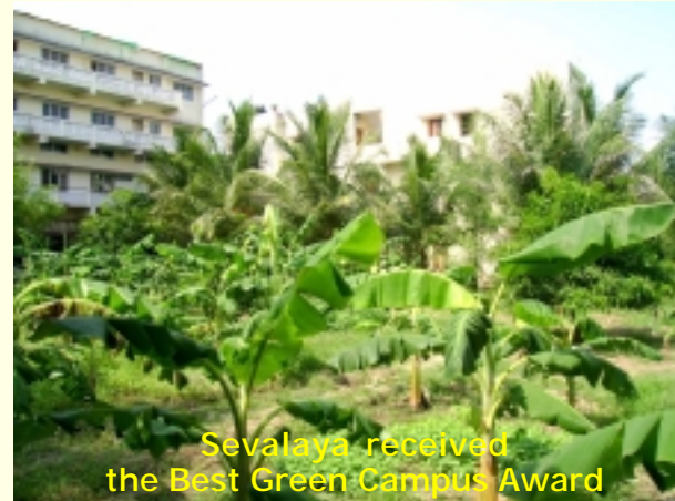
Sevalaya received the Best Green Campus Award

In the last issue we had reported that 'Atma charity wing of IIT donated Rs 50,000 to Sevalaya'. Actually Atma charity wing identifies the beneficiary organizations and the money came from students of IIT through the 'Saarang' program.