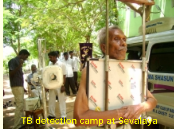
TB detection camp at Sevalaya