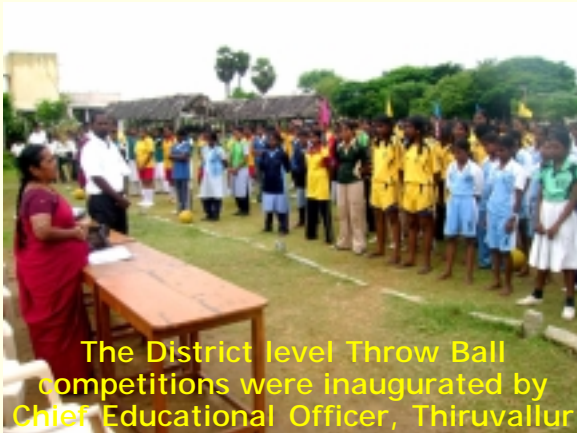
The District level Throw Ball competitions were inaugurated by Chief Educational Officer, Thiruvallur

25 students from 9 th & 11 th standard participated in the second round of quiz programme conducted by Associates of Tata Consultancy Services at their Siruseri office, Chennai on 27/09/2008.