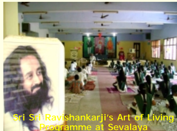
Sri Sri Ravishankarji's Art of Living Programme at Sevalaya

On 08/09/2008 the District level Throw Ball competition was held at Sevalaya. The competitions were inaugurated by Chief Educational Officer, Thiruvallur in which 14 teams participated. The Senior Girls Throw Ball Team from SBOA Model School was the Winner & Sevalaya's Senior Girls Throw Ball Team was the Runner up.