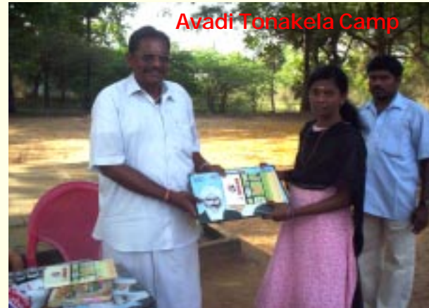
Avadi Tonakela Camp