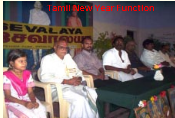
Tamil New Year Function

support for Sevalaya by providing free vegetables in the years to come.