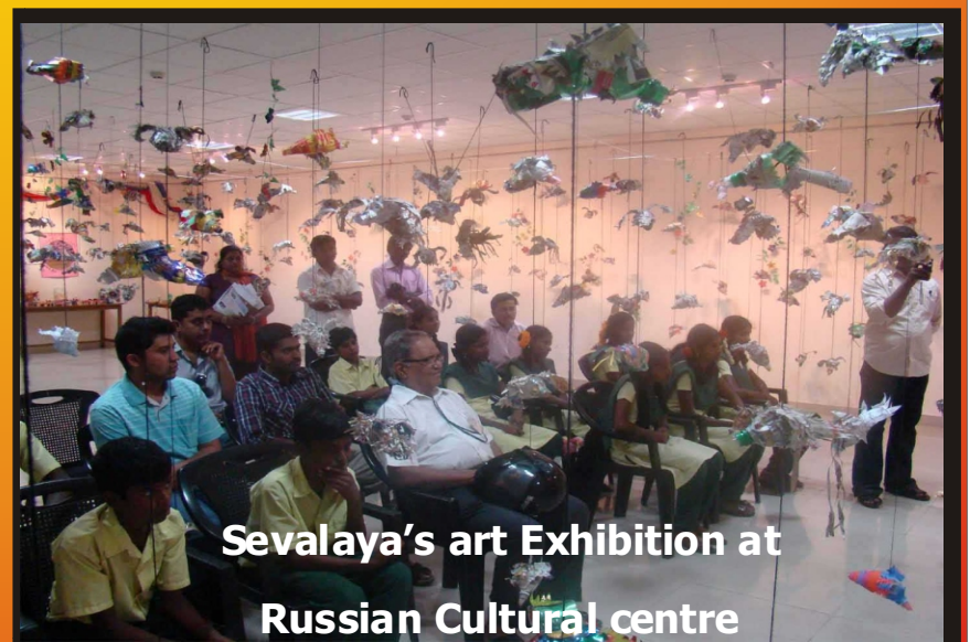
Sevalaya's art Exhibition at Russian Cultural centre