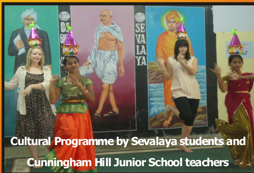
Cultural Programme by Sevalaya students and Cunningham Hill Junior School teachers