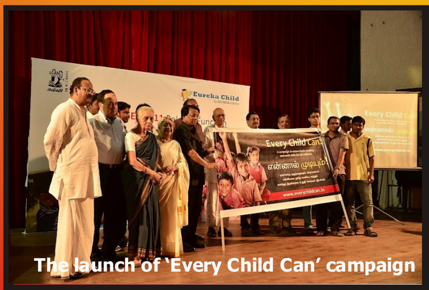
The launch of 'Every Child Can' campaign

On 18/02/2012, 18 primary school staff participated in CRC training in Pakkam & Veppampat, organized by District Elementary Education Officer, Thiruvallur.