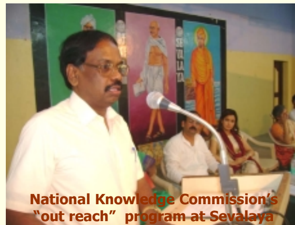
National Knowledge Commission's "out reach" program at Sevalaya