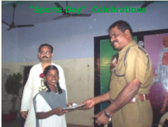
"Sports Day" Celebrations

10 children from Sevalaya participated in the Carnatic Music Appreciation Programme conducted at Rani Seethai Hall, Chennai on 10/02/2007.