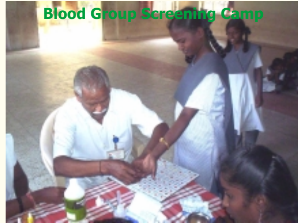
Blood Group Screening Camp