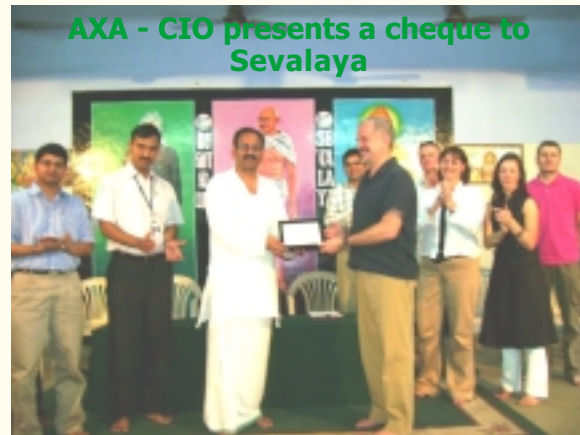
AXA - CIO presents a cheque to Sevalaya

Sevalaya organised an Awareness Campaign