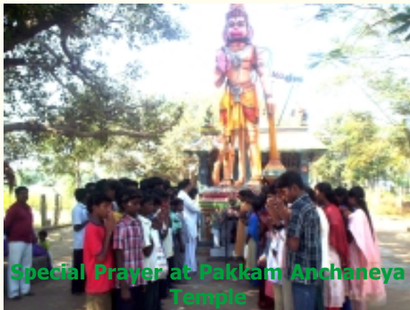
Special Prayer at Pakkam Anchaneya Temple