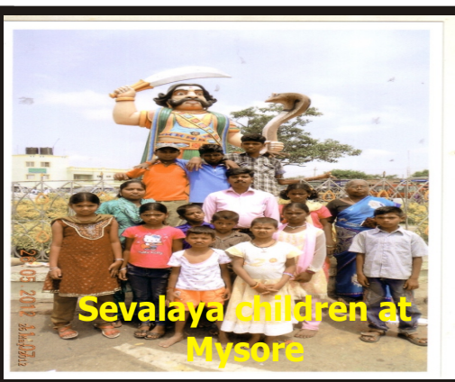
Sevalaya children at Mysore