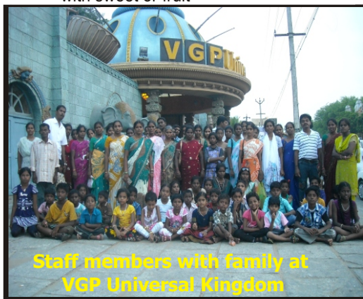
Staff members with family at VGP Universal Kingdom