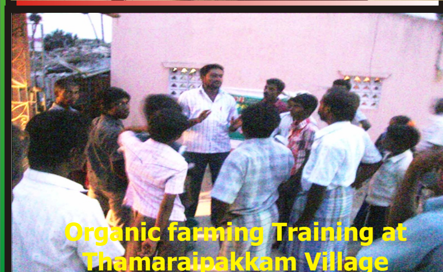
Organic farming Training at Thamarapakkam Village