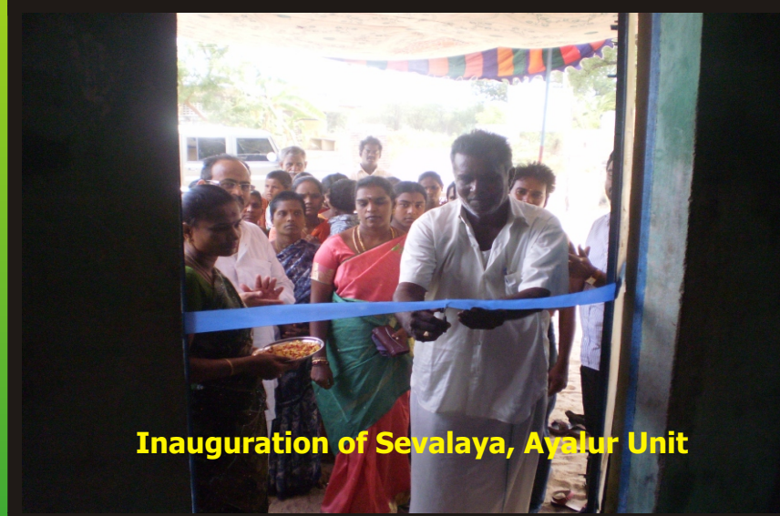
Inauguration of Sevalaya, Ayalur Unit