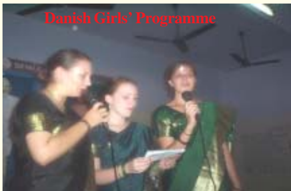
Danish Girls' Programme

Hostel Students went to the Amman Temple Festival on 15/05/2005, at Kasuva. The Hostel boys were taken on visit to the