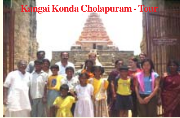
Kangai Konda Cholapuram - Tour

Vinayaka Temple at Ramanathapuram village on 21/05/2005.