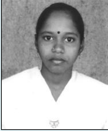
B.Rajeswari I Place

The table below gives the marks secured by our students in various subjects (out of 100) and an analysis of their performance.