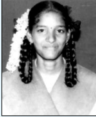
A.Meenakshi II Place