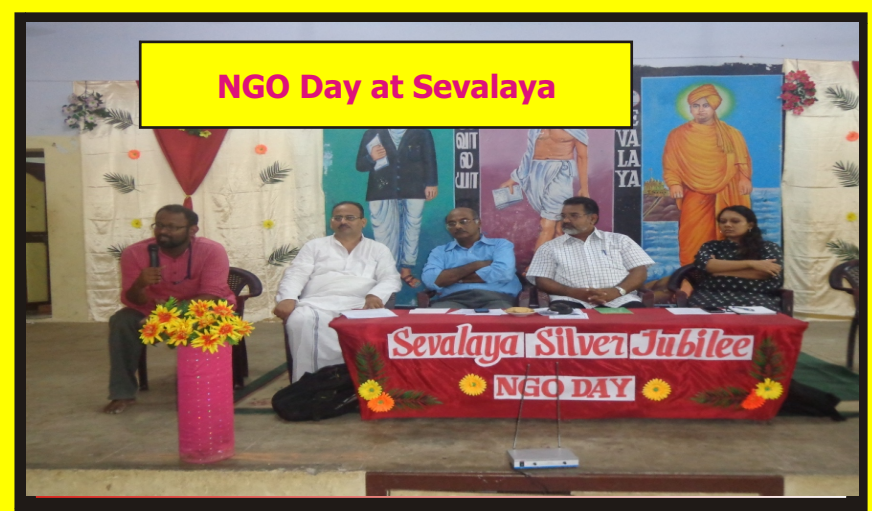
NGO Day at Sevalaya