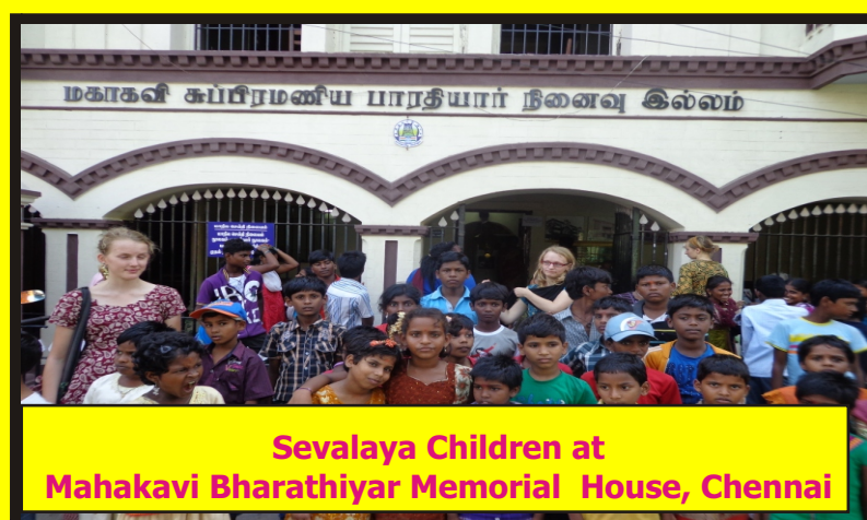
Sevalaya Children at Mahakavi Bharathiyar Memorial House, Chennai