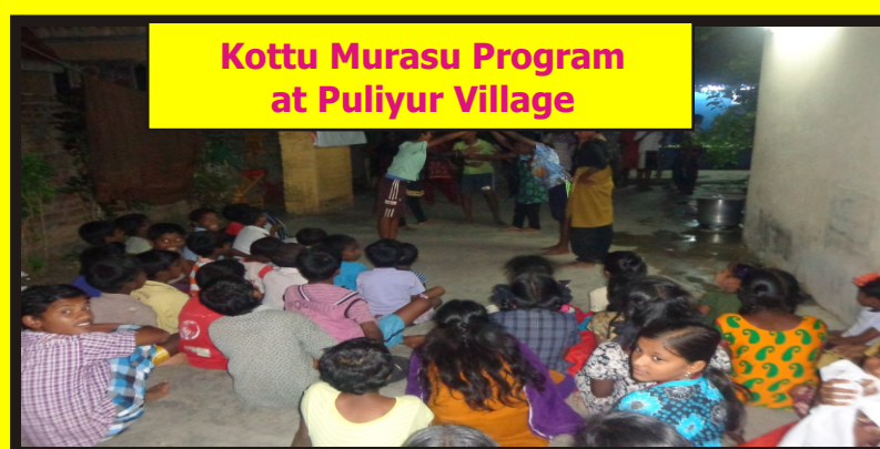
Kottu Murasu Program at Puliyur Village