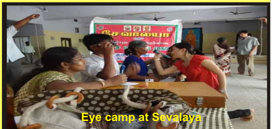
Eye camp at Sevalaya