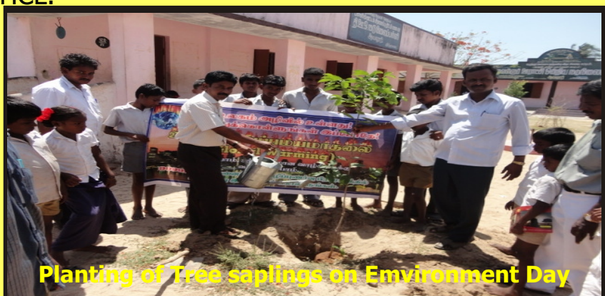
Planting of Tree saplings on Environment Day

On 23/06/2012 B.Parthiban of X Std spoke about the book "How to get above ninety percentage."