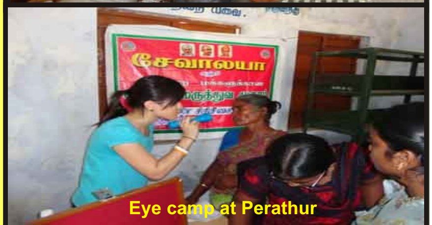
Eye camp at Perathur