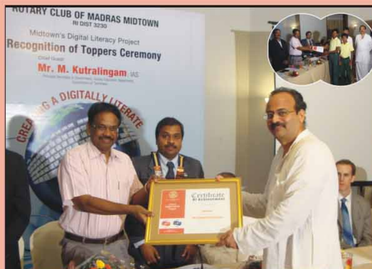
"Digital Literacy Project- Recognition of Toppers Ceremony".