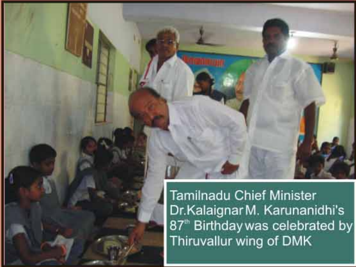
Tamilnadu Chief Minister Dr.Kalaingar M. Karunanidhi's 87 th Birthday was celebrated by Thiruvallur wing of DMK

On 20/06/2010, Sevalaya's hostel students participated in a programme for "Spritual Education" organized by Sri Sathya Sai Seva Samithi, Pattabiram .