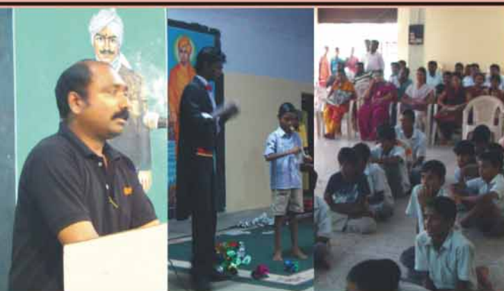
Magic Show Program by Naraiyuran Company to Hostel Students