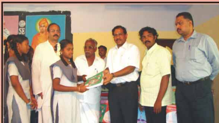
Distribution of Free Educational kit