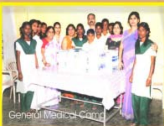
General Medical Camp