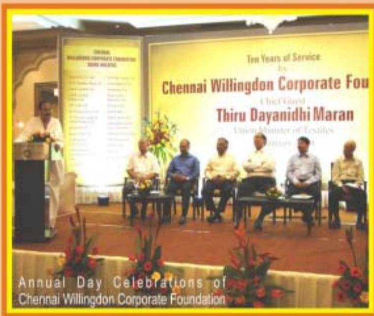
Annual Day Celebrations of Chennai Willingdon Corporate Foundation