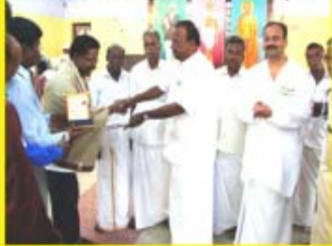
Thiruvattur Congress at Sevalaya