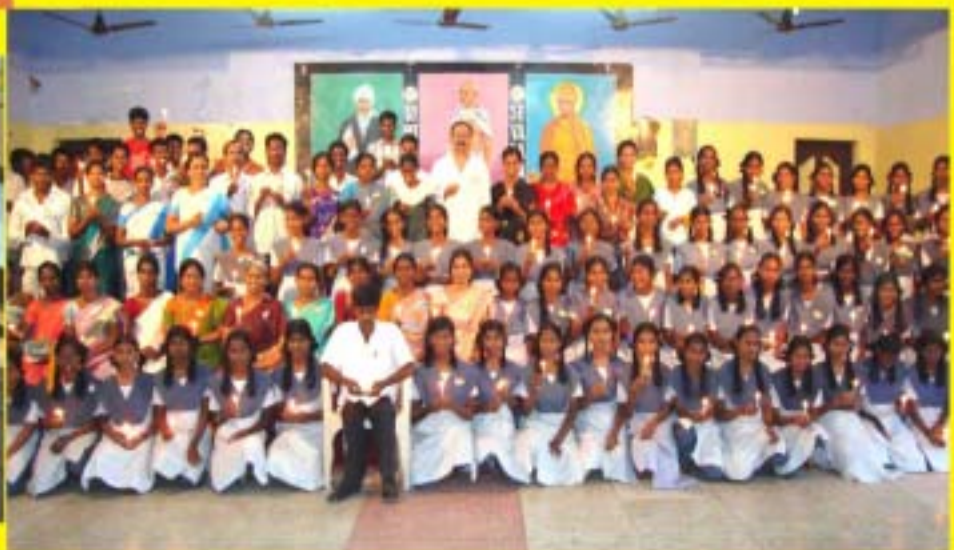
Farewell party for the outgoing XII std Students