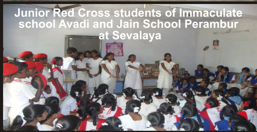
Junior Red Cross students of Immaculate school Avadi and Jain School Perambur at Sevalaya