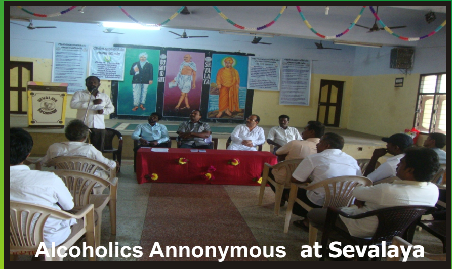
Alcoholics Anonymous at Sevalaya

Members of Arpanam an NGO celebrated Women's Day in a novel way by spending their time with the residents of Sevalaya on 05/03/2012.