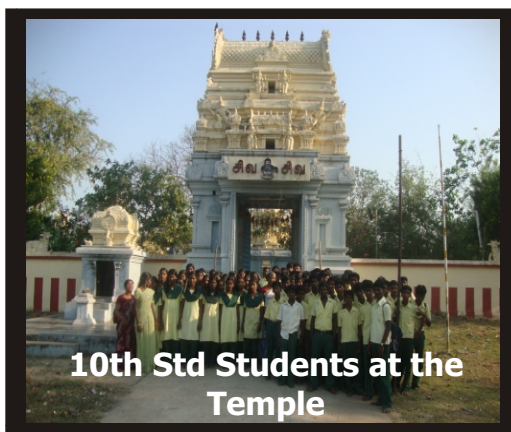
10th Std Students at the Temple