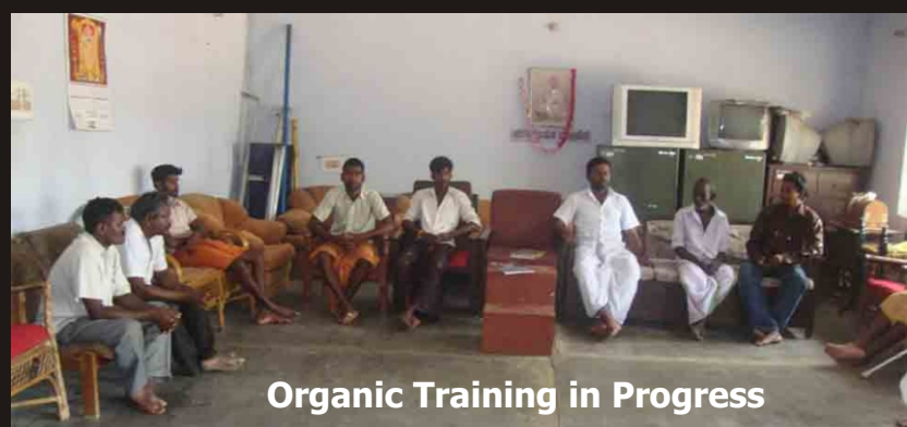
Organic Training in Progress

Forest officers of Poondi forest organized World Forest Day celebrations on 21/03/2012 at Sevalaya. Members of Junior Red Cross and Karuna club took out a rally reinforcing the importance of planting and nurturing trees and safeguarding the existing ones. School students presented a small mime on the same concept. The Forest department gave away prizes to students of Pasumai Padai clubs of Thiruvallur who had shown great concern and sincerity in all their projects and to a farmer from Kadambathur for planting a large number of trees in his farm. Sevalaya got the best campus award from Tamil Nadu forest department for growing many trees inside the school campus.