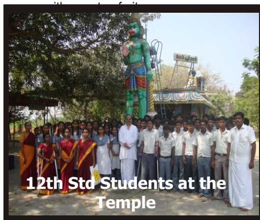
12th Std Students at the Temple