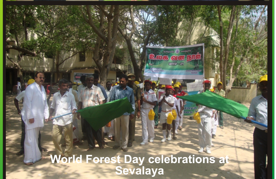
World Forest Day celebrations at Sevalaya