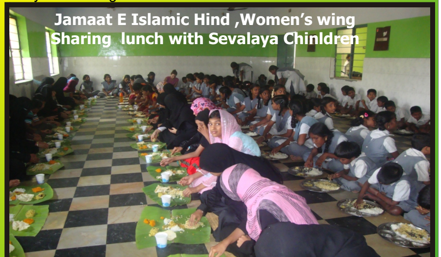
Jamaat E Islamic Hind ,Women's wing Sharing lunch with Sevalaya Chindren

On 02/03/2012 boys went to the Perumal kovil at Kaliyanur kandikai and on 03/03/2012 girls went to the Vinayagar Kovil at Kasuva Main Road. On 17/03/2012 boys went to the Vinayagar Kovil at Kasuva Village and girls went to the Perumal Kovil at Kaliyanur Kandigai.