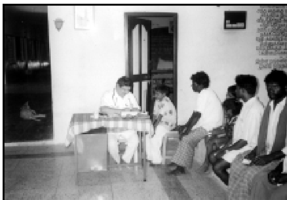
Siddha Medical Camp